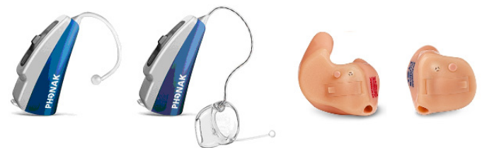
Fig. 1: Illustration of the Phonak CROS BTE and ITE transmitter options. Due to its high degree of flexibility, Phonak CROS can be combined with any type of Spice hearing instruments.

The different CROS transmitter styles are shown in Figure 1.