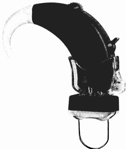
Figure 2. MLx ® wireless FM receiver coupled to a PowerZoom BTE hearing aid.

Once the fitting was verified, SG was provided instructions on the general use of the FM system. This included how to couple the FM system to the hearing aids, the various programs available through the hearing aid remote and through the FM receivers, the transmitter settings, and how to charge the FM transmitter battery. After this general instruction, SG was provided with specific instructions and practice using the FM system to improve communication with his wife in one-on-one listening situations. SG was accompanied by his wife to this session so that she could learn appropriate use of the transmitter. The audiologist demonstrated how to select the appropriate settings on the transmitter, receivers, and the hearing aid remote control. SG and his wife engaged in several role-playing activities to practice switching from hearing aid use alone to FM use alone to hearing aid and FM use combined. In addition, SG was provided a handout with step-by-step instructions for setting up the FM system for one-on-one situations. He was also given quick-reference instruction cards to carry in his pocket.