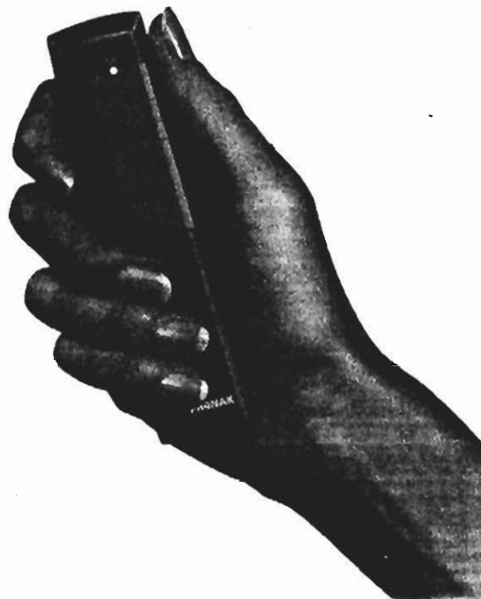
Figure 3. HandyMic ® FM transmitter.