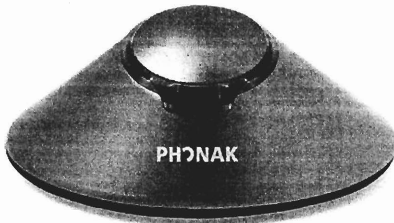
Figure 4. TelCom® FM transmitter.

During the final study visit, SG was asked to indicate his "final ability" and "degree of change" for each COSI goal, complete selected items from the CPHI and Marketrak questionnaires with a focus on FM use, indicate how much he would be willing to pay for an FM system if one were to be purchased, and finally, to decide whether or not he wished to continue using the FM system beyond the study protocol. The report by SG of his goal attainment and data collected from selected outcome measures are described.