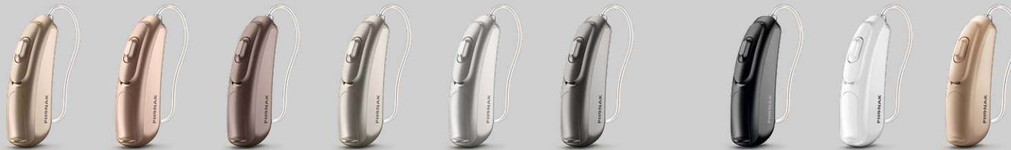
Sand Beige P1