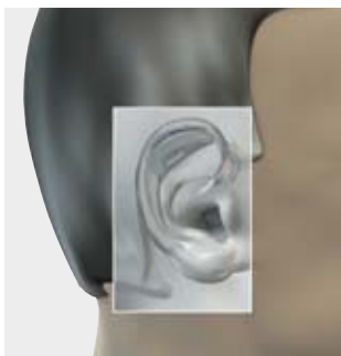
behind the ear

Discreet no matter what style you choose.