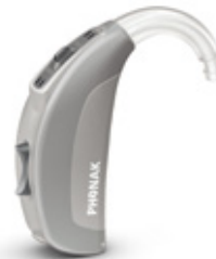
Phonak Dalia SP