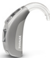
Phonak Dalia microP