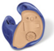
Phonak Dalia 13 UZ Petite