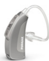
Phonak Dalia microM

Actively participating in conversations inside a restaurant. Hearing fellow passengers in a car or on a train. Innovative Phonak UltraZoom Essential technology will help you to understand speech more clearly, even in background noise.