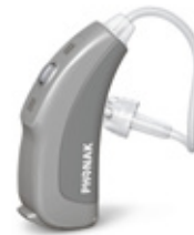
Phonak Dalia M H2O