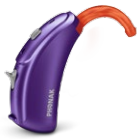
CROS II-13 with CROS Hook

A tamperproof battery door can also be ordered for the CROS II-13. Both the CROS Hook and tamperproof battery door meet the international standards for mechanical strength.