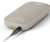
Roger Multimedia Hub