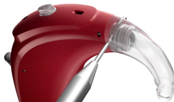
Figure 6. The Phonak tamperproof earhook being unlocked with the tool

Both standard and mini earhooks are available with a 680 filter to provide a smoothed frequency response in this frequency region. This filter is recommended because it smooths peaks that lead to feedback and makes it easier to optimize the maximum power output (MPO) of the device (Scollie & Seewald, 2002). It is important to note that these acoustic damping elements are made of absorptive fibers that can get damp or clogged. A water-logged filter can produce a muted response or even block the sound channel all together, leading one to believe that the hearing aid is nonfunctional. When troubleshooting, it is important to remove the hooks to ensure that the filter is not impeding performance. All Phonak BTEs are compatible with a mini earhook and tamperproof mini earhook. For additional piece of mind, all Phonak tamperproof accessories are designed to prevent small hearing aid parts from being removed and ingested by children and to comply with IEC standards. A small tool is needed to unlock the pediatric tamperproof earhook from the BTE (Figure 6). The earhooks are available in 6 colors (Figure 7) to make the selection of hearing aids more fun and appealing to children. They can also be changed at home and are an inexpensive way to personalize the hearing aids.