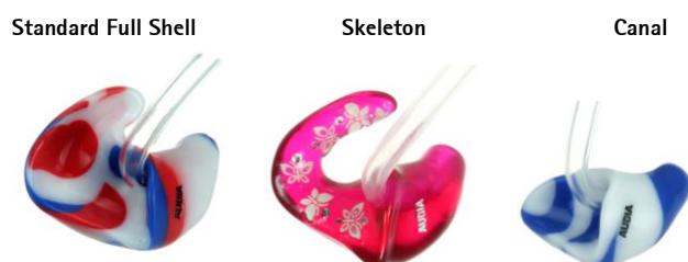
Figure 2. Earmold styles including full shell, skeleton mold and canal mold.

In the first year of life, a child may need more than six sets of earmold impressions and earmolds, so parents' expectations should be set accordingly. It is also important to note, that as the child outgrows earmolds, the acoustic properties of the ear are changing as well, necessitating new real ear to coupler difference (RECD) measurements, recalculation of targets, and adjustments of the hearing aids to maintain the same degree of audibility (Bagatto et al., 2010). Earmold venting options will often be restricted by the small size of the child's ear. Regardless of the hearing loss configuration, a vented earmold will likely not be an option early in life; however, the optimal acoustic selections for the earmold should be reconsidered as the child grows. If feedback persists in the presence of a new earmold, the audiologist may need to obtain a deeper fitting earmold down to the bony portion of the ear canal, activate the feedback management system in the hearing aid, or reassess any venting.