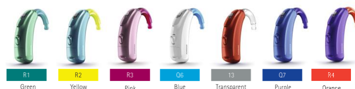
Figure 7. Phonak standard and tamperproof mini earhooks are available in 6 colors and a transparent option to personalize pediatric hearing aids.