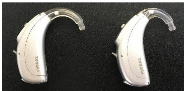
Figure 5. A BTE with a standard HE 10 680 hook (left) and a HE 10 680 mini hook (right).

Both standard and mini earhooks are available with a 680 filter to provide a smoothed frequency response in this frequency region. This filter is recommended because it smooths peaks that lead to feedback and makes it easier to optimize the maximum power output (MPO) of the device (Scollie & Seewald, 2002). It is important to note that these acoustic damping elements are made of absorptive fibers that can get damp or clogged. A water-logged filter can produce a muted response or even block the sound channel all together, leading one to believe that the hearing aid is nonfunctional. When troubleshooting, it is important to remove the hooks to ensure that the filter is not impeding performance. All Phonak BTEs are compatible with a mini earhook and tamperproof mini earhook. For additional piece of mind, all Phonak tamperproof accessories are designed to prevent small hearing aid parts from being removed and ingested by children and to comply with IEC standards. A small tool is needed to unlock the pediatric tamperproof earhook from the BTE (Figure 6). The earhooks are available in 6 colors (Figure 7) to make the selection of hearing aids more fun and appealing to children. They can also be changed at home and are an inexpensive way to personalize the hearing aids.