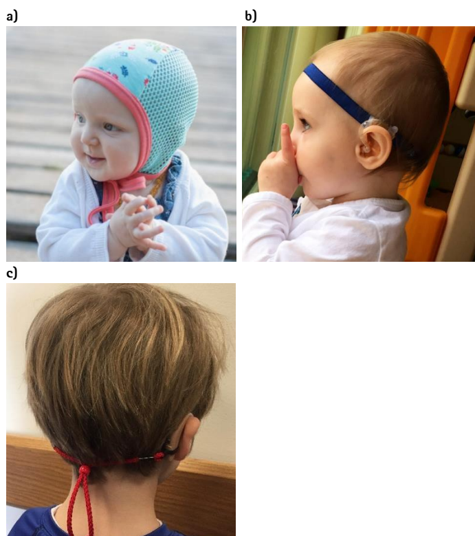
Figure 11. Retention solutions for babies include: a) pilot cap with mesh sides b) headband with sleeves, c) retention straps. Images used with permission from Emmifaye, Handmade clothing for children at https://www.etsy.com/shop/emmifaye and Ear Suspenders at https://www.etsy.com/shop/EarSuspenders .

important to ensure that the portion of the cap that covers the ears is made of a material that is not too thick creating feedback or reducing the amount of sound entering the microphone of the hearing aid. Figure 11a shows an example of a pilot cap made partially with a mesh material used for this purpose. A newer solution that many families have found useful is a stretchy headband that has a rubber holder attached to the headband to hold the hearing aid in place above the ear (Figure 11b). Once children are walking, many families find that a simple retention strap as shown in figure 11c is helpful. Whatever strategy is used, as with selection of earmold colors, the one that is used most and ensures that children are wearing their hearing aids during all of their waking hours is the best choice.