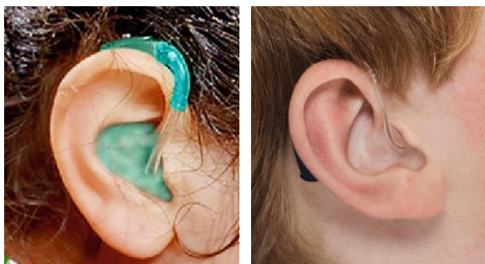
Figure 8. Traditional earhook and tubing on the left. SlimTube pictured on the right.

compromises. Maximum gain and output is reduced 5-10 dB with the SlimTubes compared to the HE 10 680 standard earhook. The standard SlimTube is offered in sizes 0-3 and the Power SlimTube (compatible with Naída and Sky SP and UP) is offered in sizes 00-3. Size 0 generally works for children down to about 7 years of age. Since a SlimTube can reduce the gain and output of the device, the effects of which cannot be simulated in the coupler, it is advised to always do real ear verification of these fittings rather than simulated test box fittings using real ear to coupler differences (RECDs).