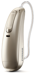
Phonak CROS P-13