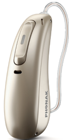
Phonak CROS P-R

For your better-hearing ear, you can pair with an Audéo P-13T, P-R or P-RT hearing aid.